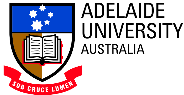
Figure 4.1. The University of Adelaide. The logo of the University of Adelaide is shown above. It is best to save all graphics in .eps format.

We can refer to the logo here. See Figure 4.1