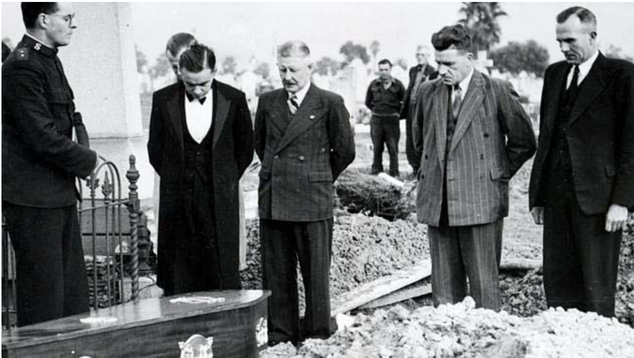
The funeral of the Somerton Man at West Terrace in 1948. There are new moves to exhume his body to obtain DNA samples.