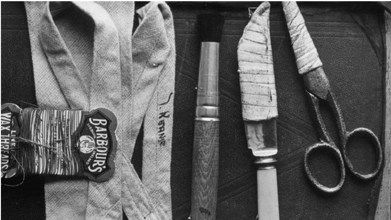
The contents of a bag found with the Somerton Man's body.